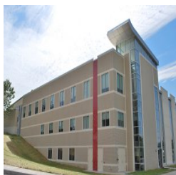
Cor Jesu Academy's New Gymnasium & Student Commons