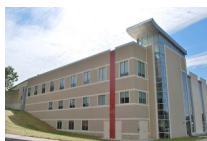
Cor Jesu Academy's New Gymnasium & Student Commons